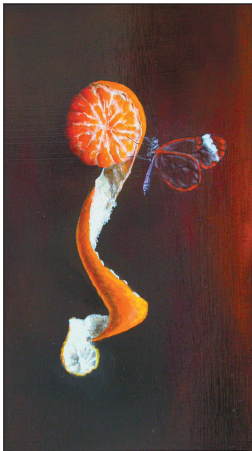
Tangerine and Butterfly, oil on canvas, 16"x8"