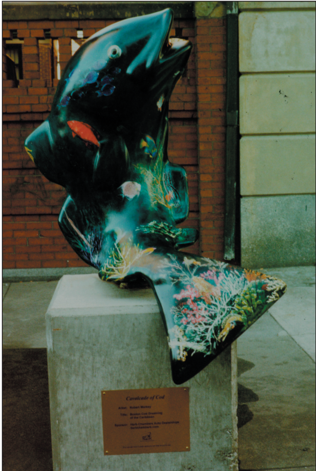
Boston Cod Dreaming of the Carribean, acrylic painted fiberglass sculpture, 4'x2'x2'