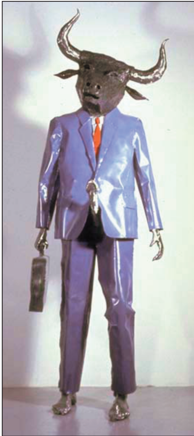
American Minotaur, welded steel, 80"x30"x24"