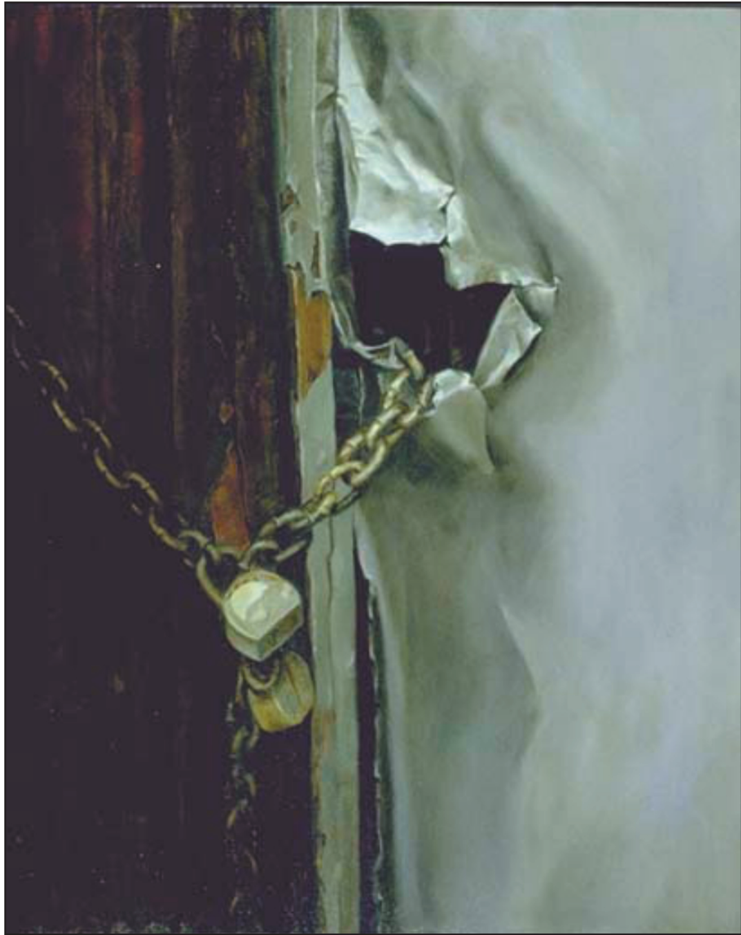
Gray Door, oil on canvas, 30"x24: