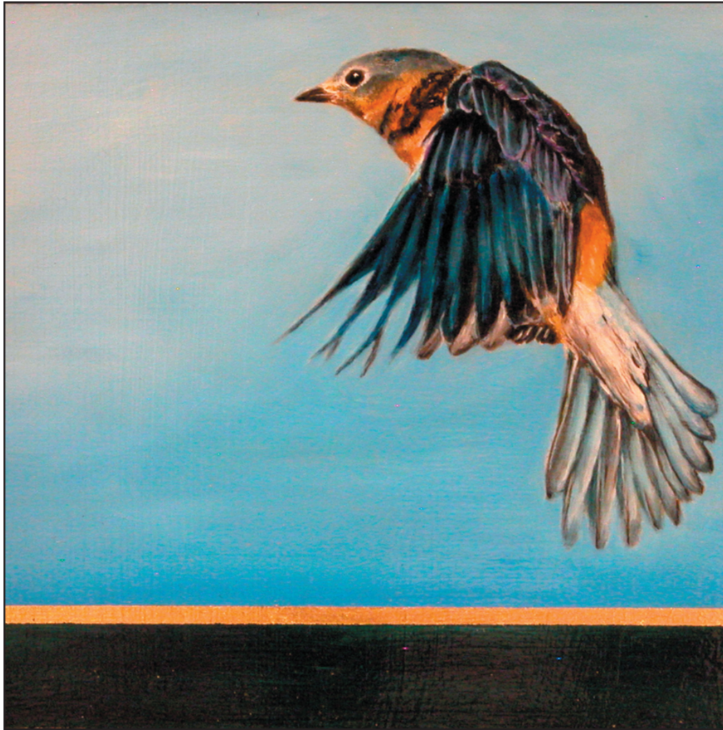
Cave Swallow, oil on panel, 8"x8"