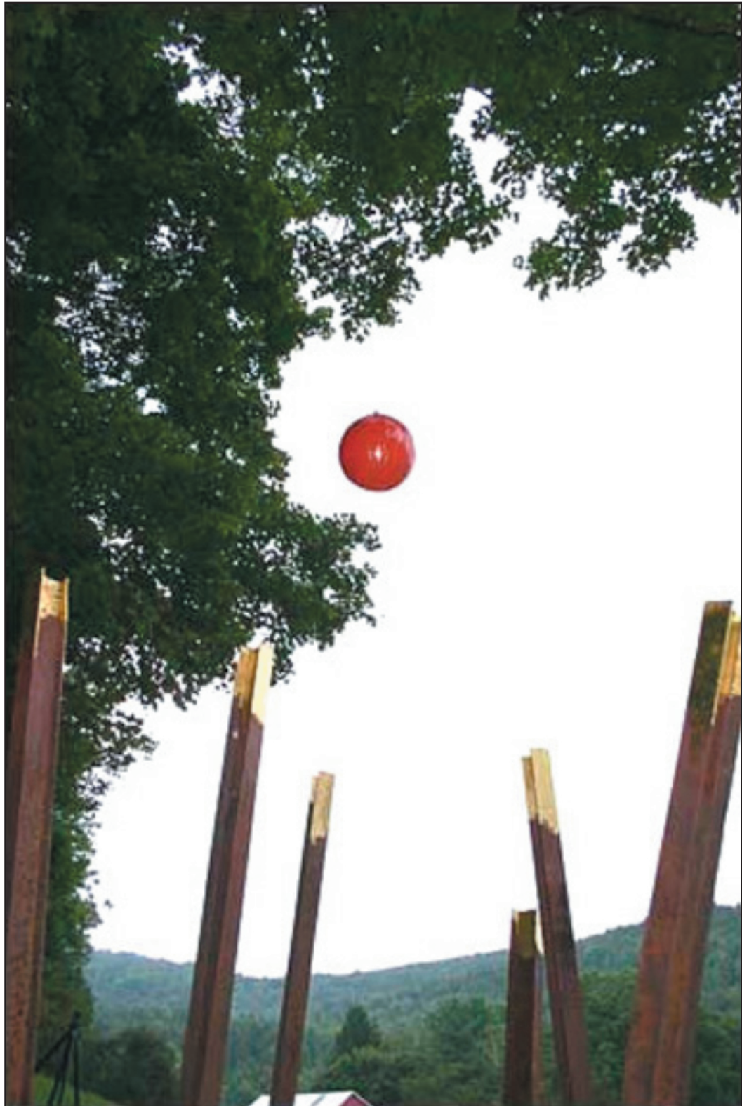
Floating World, steel, glass, gold leaf, 12'x10'x10'