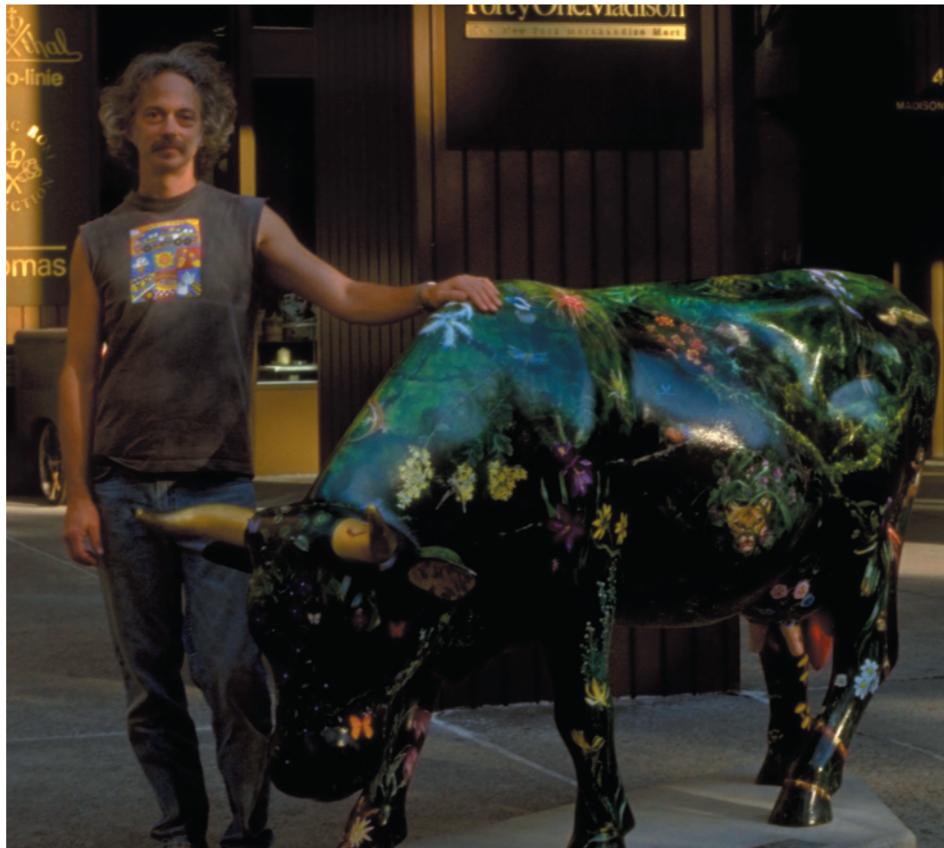
Amoozon Rain Forest, acrylic painted fiberglass sculpture, 4'x8'x2'