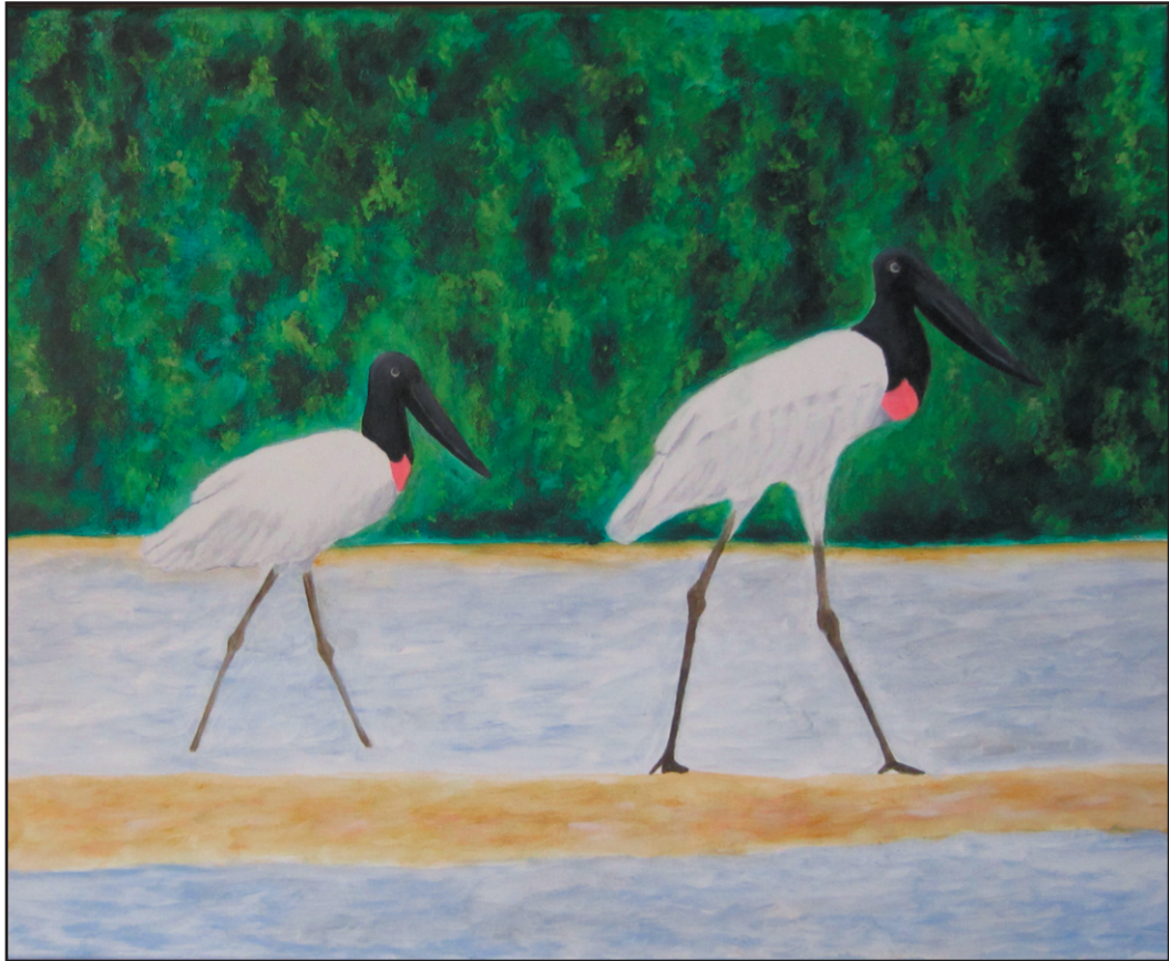
Bazilian Jabirus, oil on canvas, 18"x24"