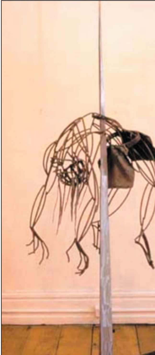
500 Years, welded steel, 90"x20"x24"