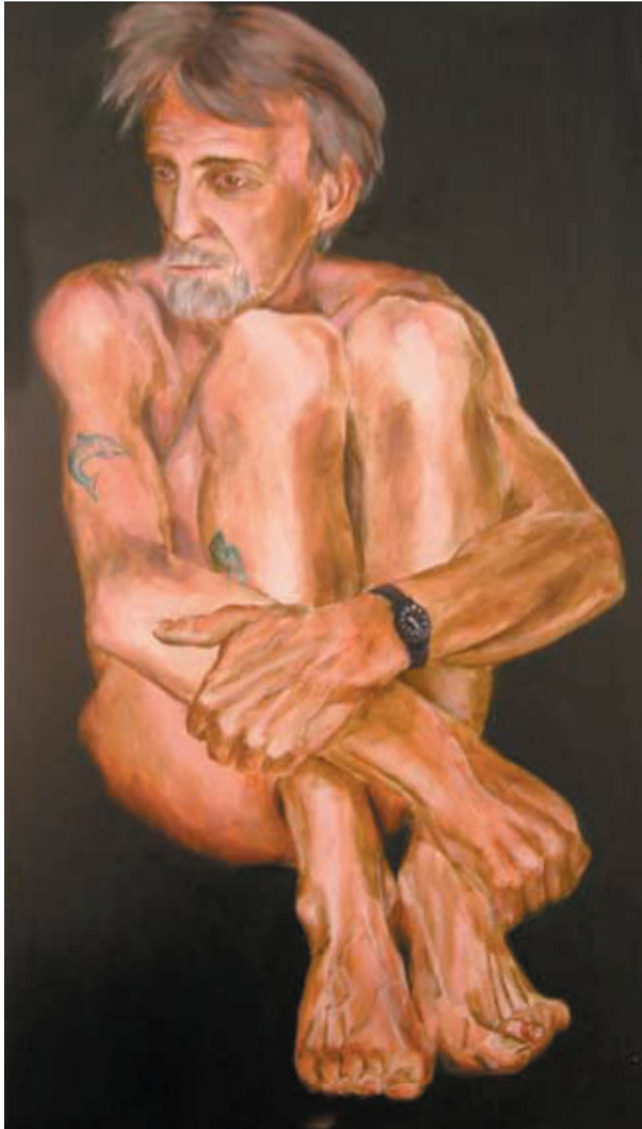
Ben, oil on canvas, 22"x12"