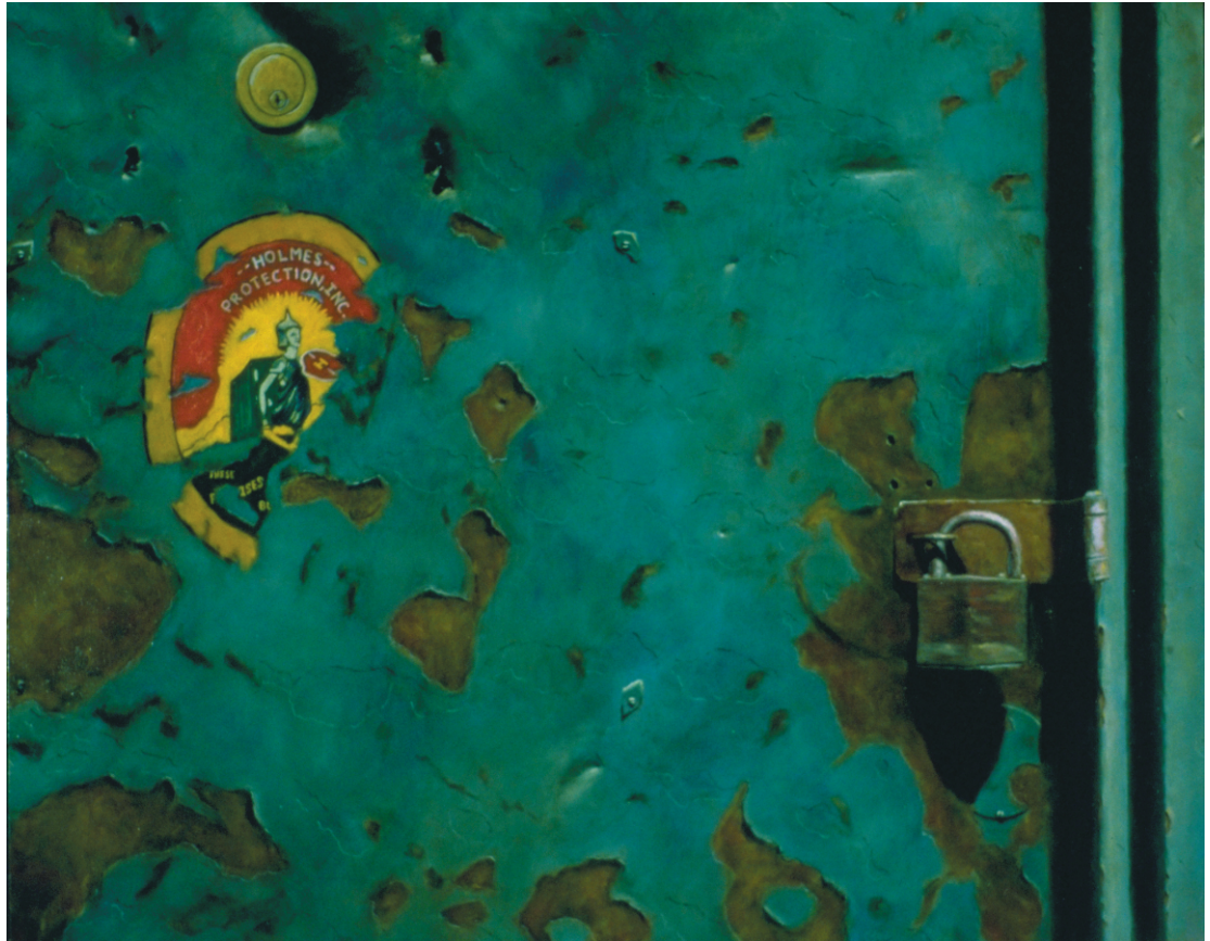
Blue Door, oil on canvas, 24"x30"