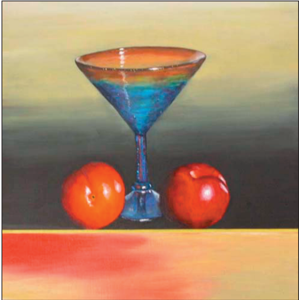
Plums and Glass, oil on canvas, 12"x12"