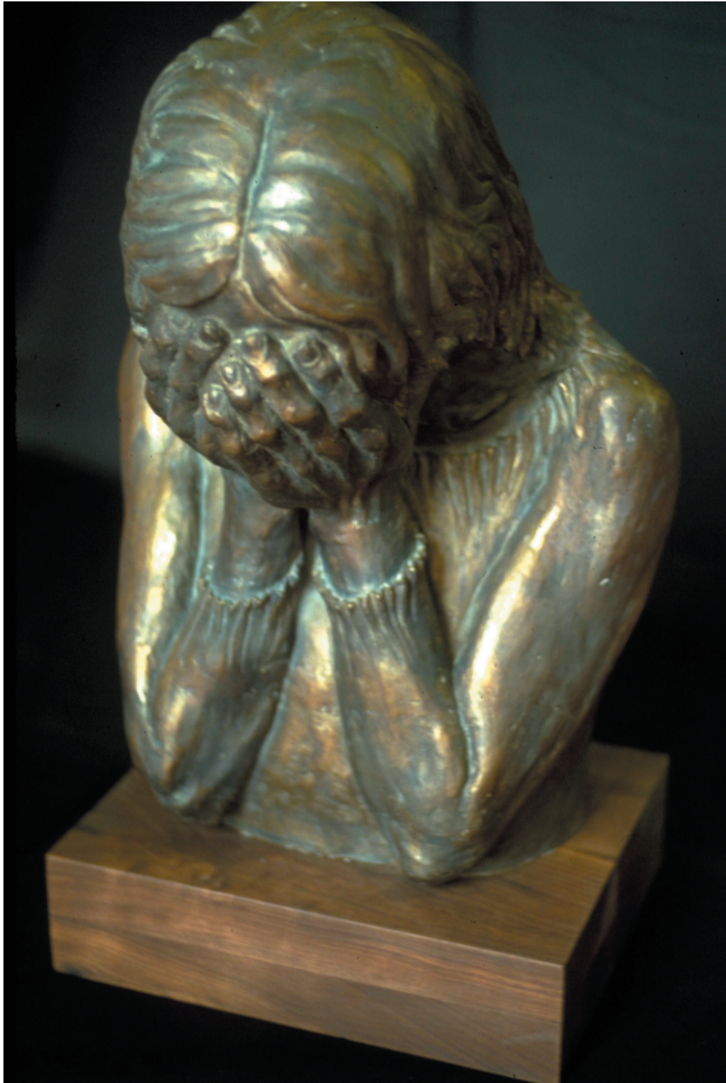
Grieving Mother, bronze, 20"x14"x12"