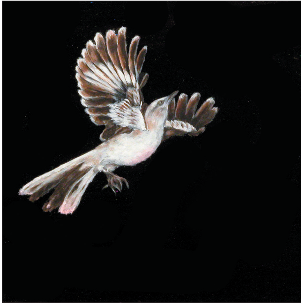
Northern Mockingbird, oil on panel, 8"x8"