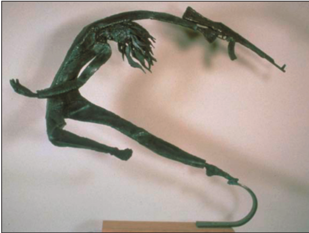
If I can't Dance, I don't Want Your Revolution, welded steel, 24"x30"x8"