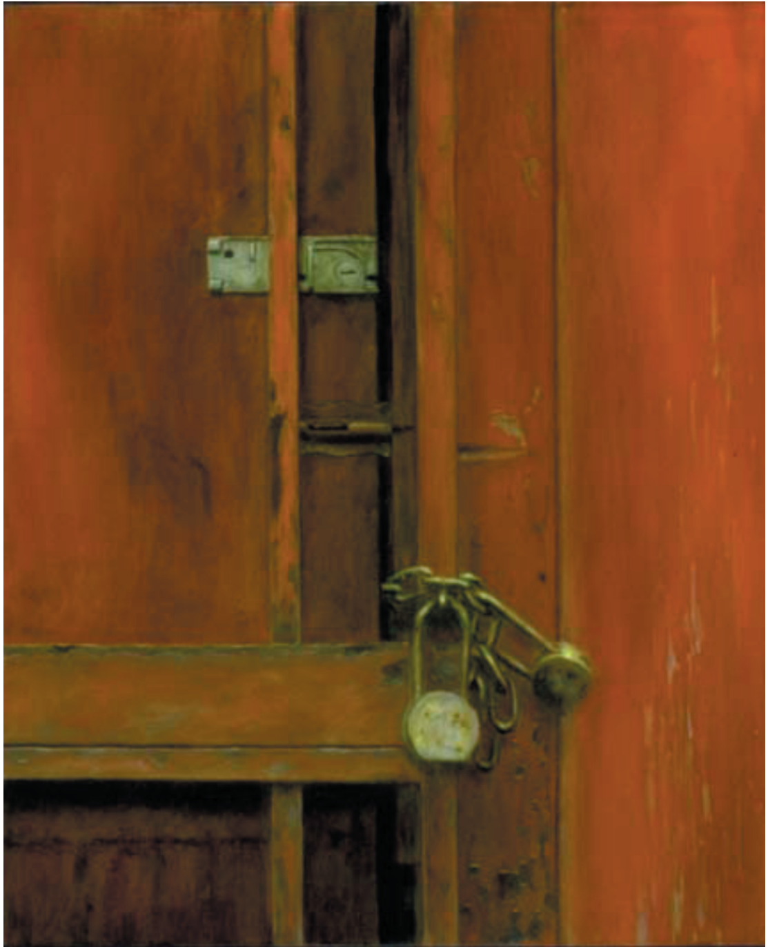
Red Door, oil on canvas, 30"x24"