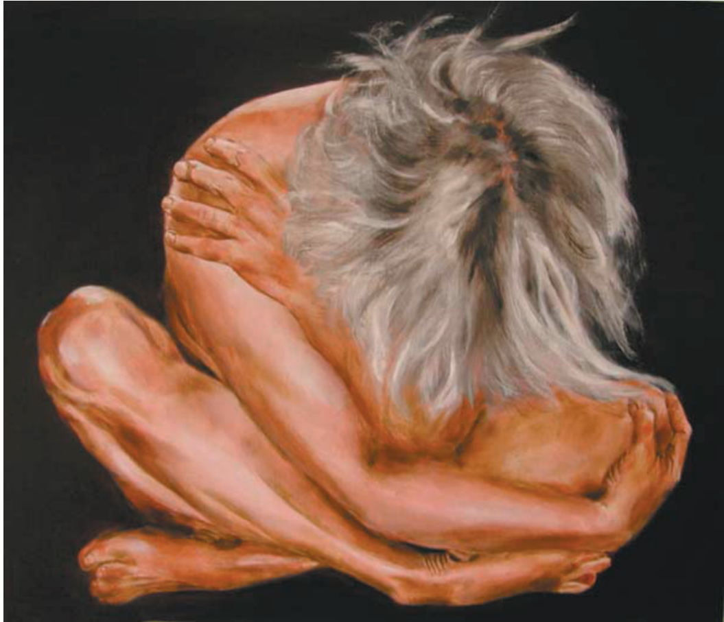
Lynda, oil on canvas, 13"x12"