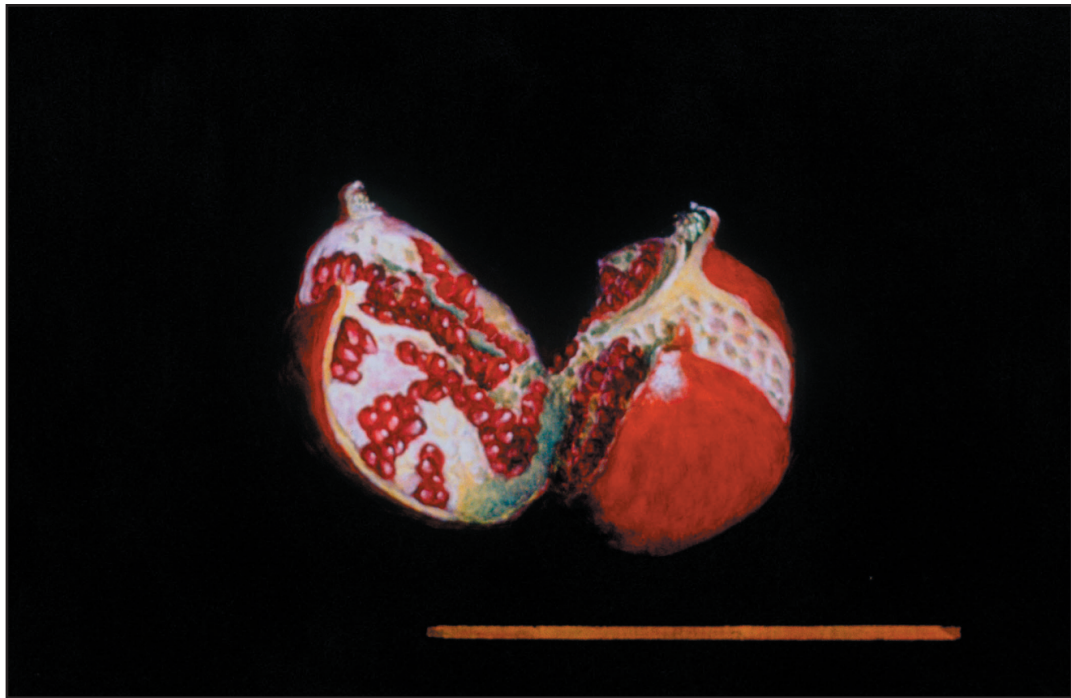
Pomegranate, oil on canvas, 10"x16"