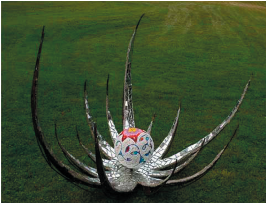
Emergence, welded steel, ferrocement, mosaic with marble, smalti, and mirror, 4'x4'x4'