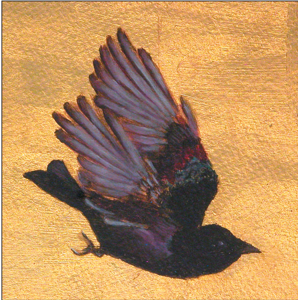
Starling on Gold Leaf, oil on panel, 5"x5"