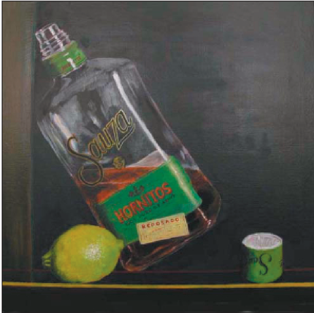
Lime and Tequila, oil on canvas, 12"x12"